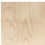
Ash Whitened Oil