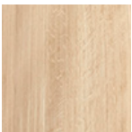
Oak Whitened Oil