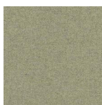
Divina MD 0913