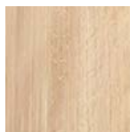
Oak Whitened Oil