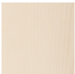
Sycamore Whitened Oil